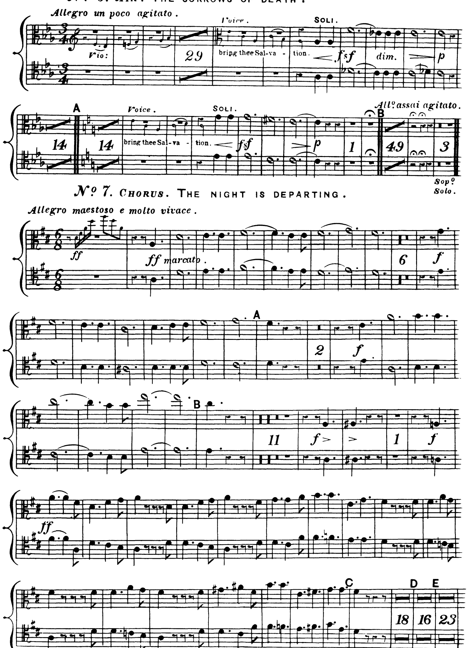
\mathcal{N}^o 6. Air. The sorrows of death .