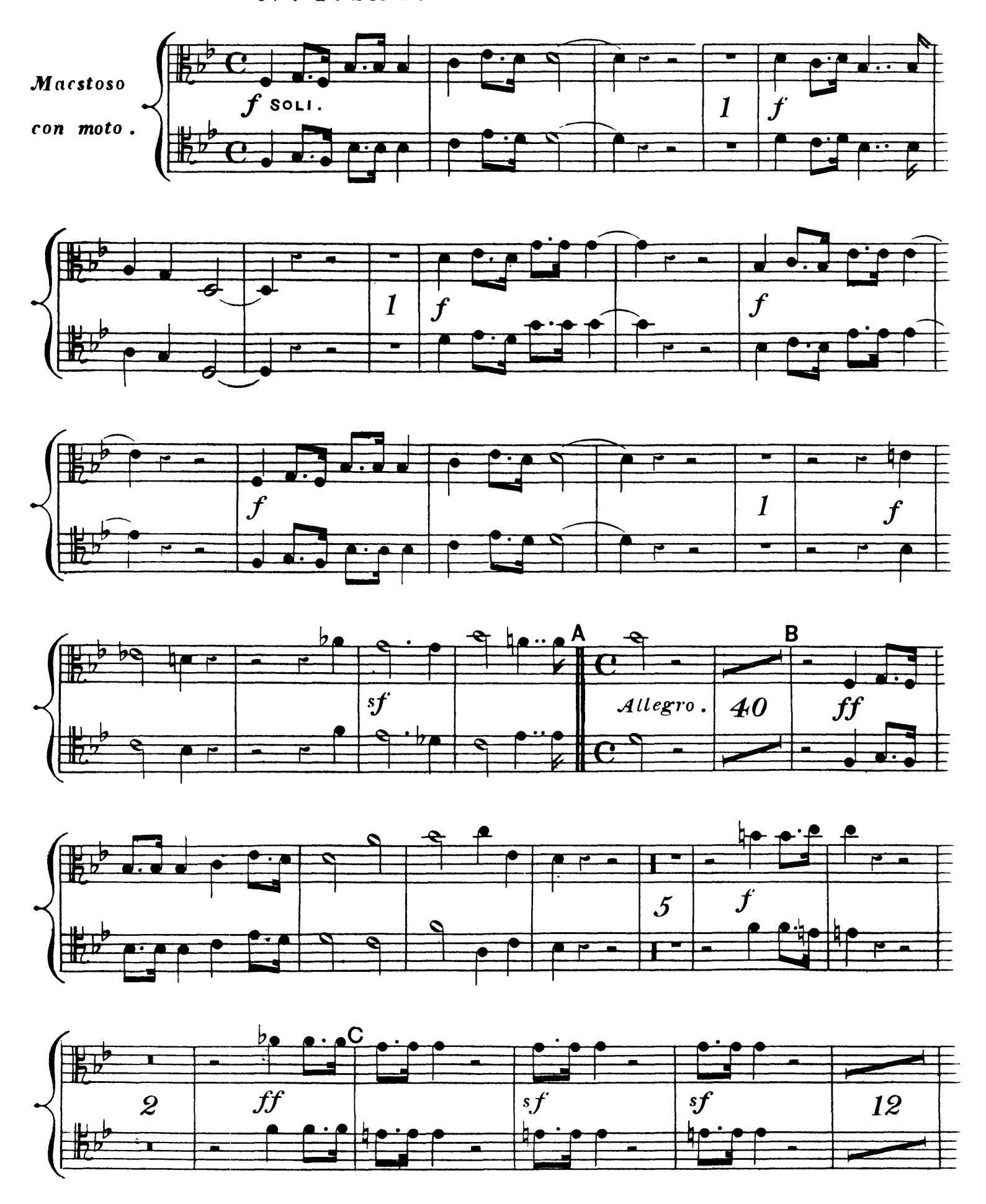
Nº 1. SINFONIA.