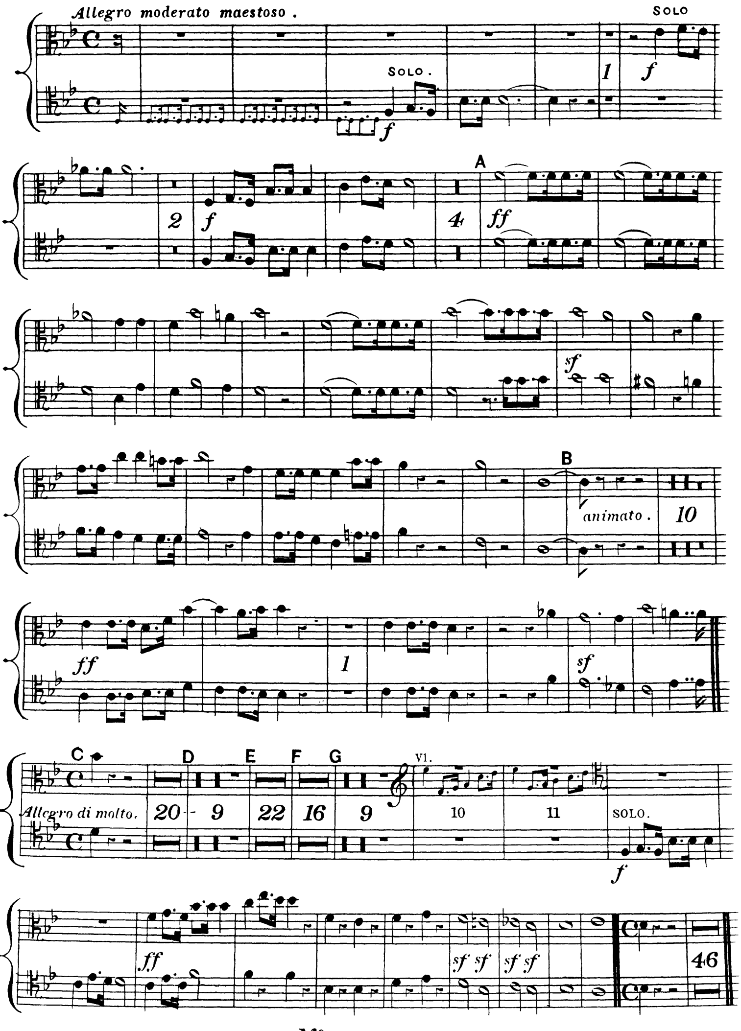
N^{o} 3.4.5. TACET.