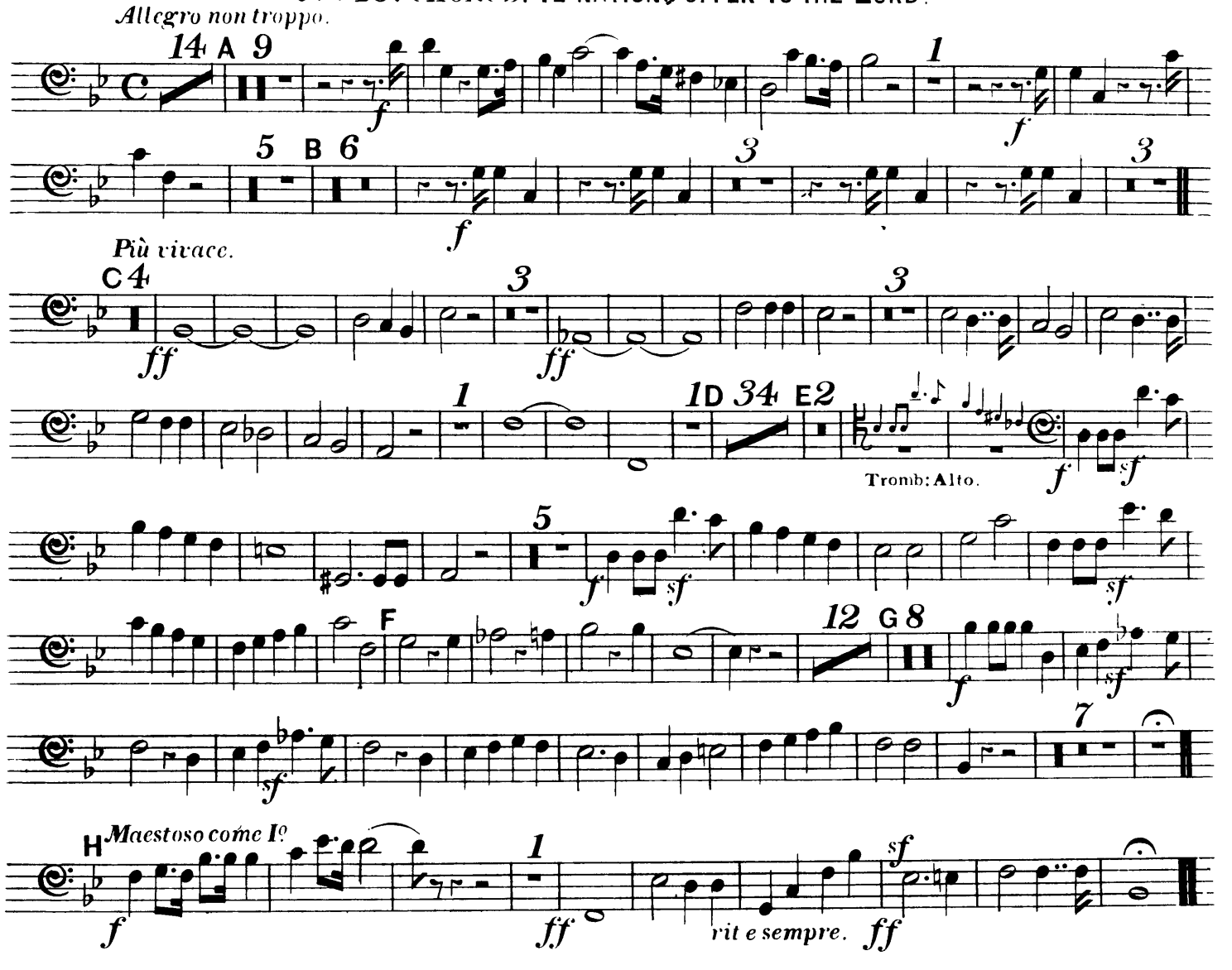
\mathcal{N}^{\circ} 10. CHORUS. YE NATIONS OFFER TO THE LORD.