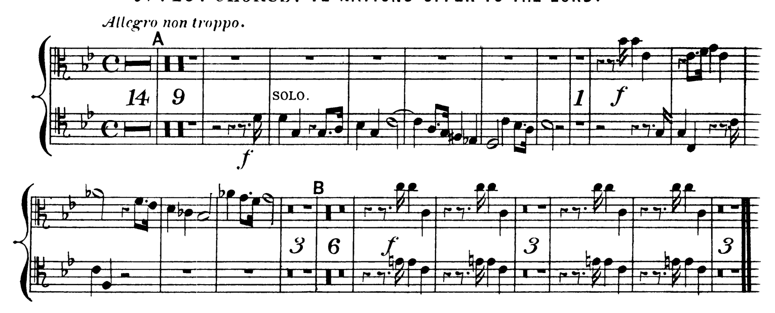
\mathcal{N}^{\circ} 10. Chorus. Ye nations offer to the Lord.