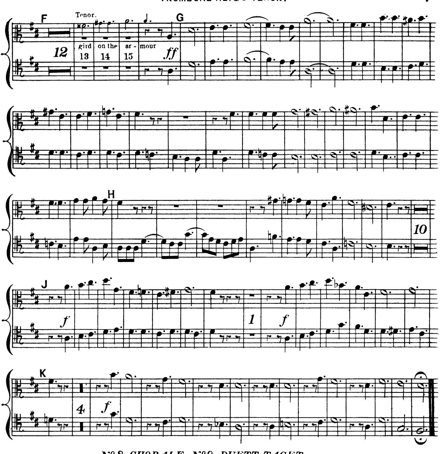
Nº 8. CHORALE. Nº 9. DUETT TACET.