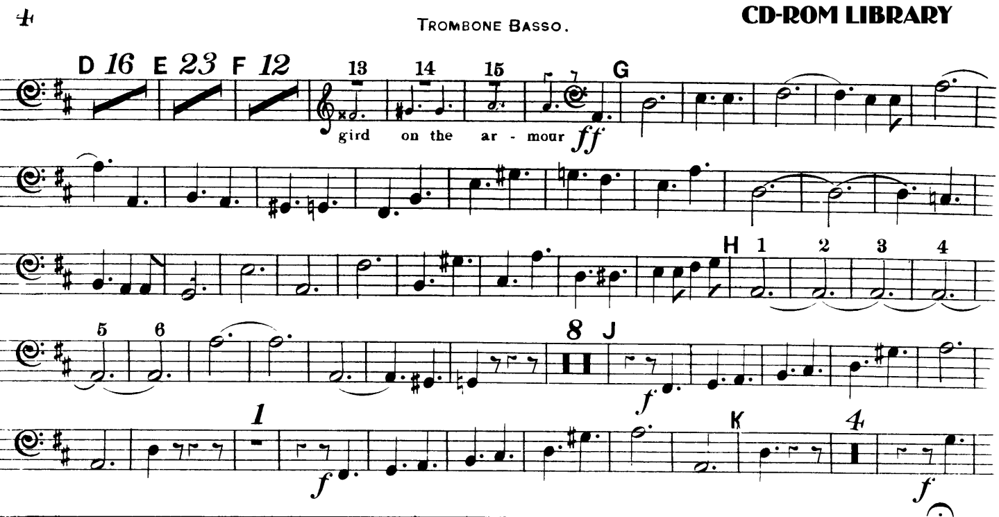
Nº8.CHORALE.TACET. Nº 9. DUETT. TACET.